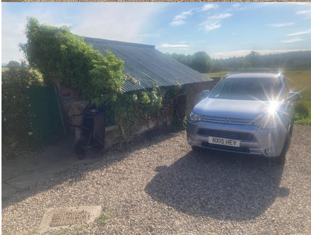
Photo of guest parking area

A wheelbarrow is provided next to the parking space for your luggage – help yourself and make your way up to the hut. It's about 150 yards and can be muddy when wet so you might want to get into your wellies in the wetter months.